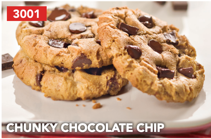
CHUNKY CHOCOLATE CHIP