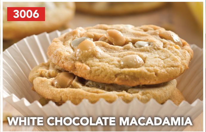
WHITE CHOCOLATE MACADAMIA